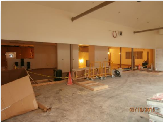
Food Service Kitchen/Servery