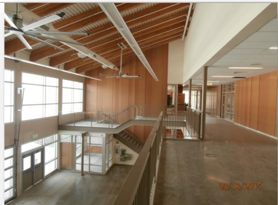
South Shared Activity Area