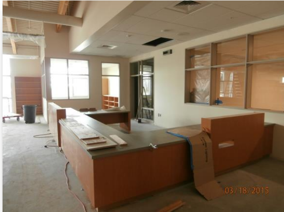
Library Checkout Desk