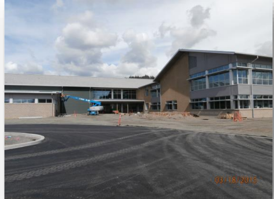
Main Entry and Library