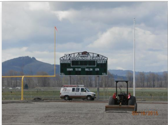
Scoreboard at Football