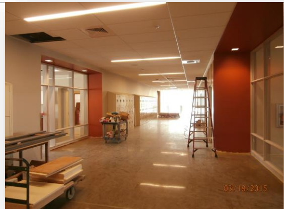
Second Floor Concourse