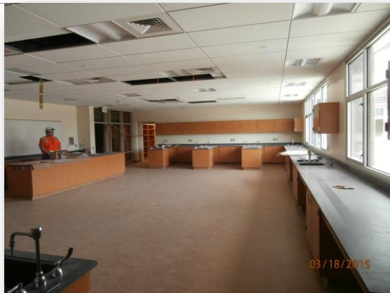
Typical Science Room