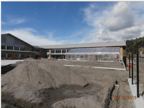
Greenhouse and Courtyard