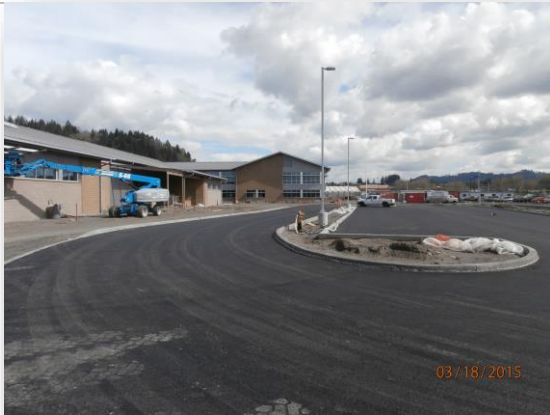
Passenger drop area at Front Entry