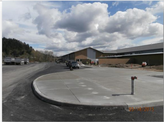
North Parking Lot