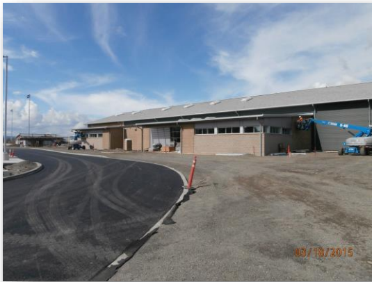
South Classroom wing

Additional photos available via web camera access: www.dwpwebcams.com/whs/desktop.htm