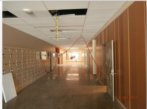
Second Floor Concourse