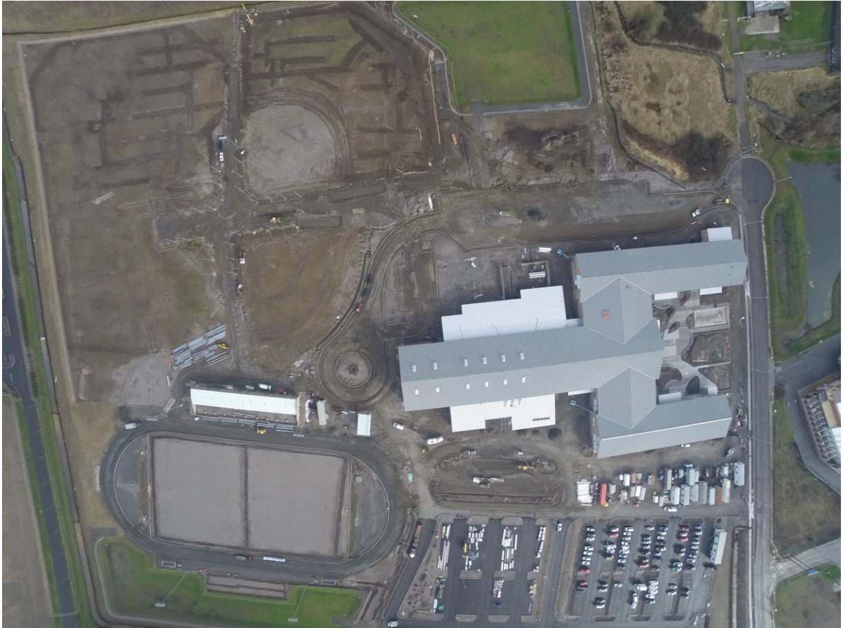
Aerial view 03.01.2014